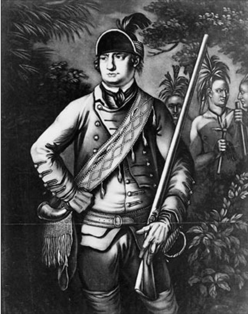
This mezzotint by Thomas Hart, engraved in London in 1776, is the best-known image of Major Robert Rogers; there are no known images of him taken from life.

derived entirely from his associate Robert Rogers, a well-known British American army officer in the French and Indian War. Rogers used the name in the petition he submitted to the Board of Trade and Plantations when he was in London in August 1765. 3