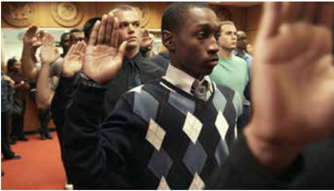
A young man taking the oath of enlistment at Ft. Hamilton, Brooklyn.

On April 27 & 28, West Virginia Public Broadcasting presents two nights of programs dedicated to remembering the 40th anniversary of the fall of Saigon and the impact of the Vietnam war. These programs will be available to watch free on demand for a limited time after broadcast at http://video.wvpublic.org/