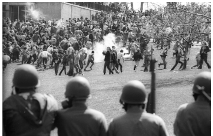
May 4, 1970. Students retreat up Blanket Hill as guards advance with tear gas.

In May 1970, four students were shot dead at Kent State. The mayhem that followed has been called the most divisive moment in American history since the Civil War. From college campuses to the jungles of Cambodia, to the Nixon White House, The Day the 60's Died returns to that turbulent spring 45 years ago.