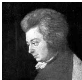
Wolfgang Amadè Mozart Born in Salzburg, January 27, 1756 Died in Vienna, December 5, 1791

The recognition of Mozart as the universal genius of music has gone virtually unchallenged for more than two centuries. No other musician during this time, no matter how great, can claim to have excelled in the composition of so many kinds of music. That Mozart was a peerless performer as well only adds to the miracle of his achievement and to our wonder at it. Indeed Mozart wrote nearly everything—keyboard, vocal, sacred, and chamber music, symphonies, and opera. And it is that last area—dramatic music—that has proved the stumbling block for even the mightiest. Beethoven labored over Fidelio for years and wrote three versions altogether. Brahms never produced an opera, while Haydn, Schubert, and other masters wrote many, but their works failed in performance. On the other hand, Rossini, Wagner, Verdi, and so many of the eminent opera composers are remembered today almost exclusively for their dramatic efforts.