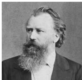
Johannes Brahms Born in Hamburg, May 7, 1833 Died in Vienna, April 3, 1897