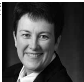
Jennifer Higdon Born in Brooklyn, New York, December 31, 1962 Now living in Philadelphia