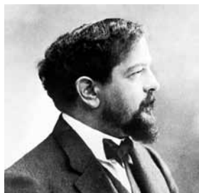
Claude Debussy Born in Saint-Germain- en-Laye, France, August 22, 1862 Died in Paris, March 25, 1918

Debussy strongly rejected the word that most came to be associated with his music: Impressionism. The term was first applied to the visual arts. In the 1870s a French critic used it derisively in response to Claude Monet's Impression: Sunrise , whereupon the painter decided to appropriate the name that came to characterize an entire movement. Together with colleagues such as Manet, Degas, and Renoir, Monet still painted representational images, but he and the "Impressionists" boldly turned away from the realism of French academic and salon painters. Debussy harbored similar aims for music: "I am trying in some way to do 'something different'—an effect of reality—what some imbeciles call 'Impressionism,' a term that is utterly misapplied, especially by the critics."