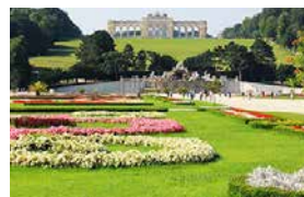
Schoenbrunn Palace, Vienna