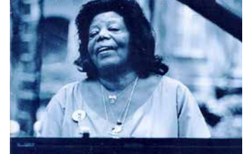
Mary Lou Williams, 2005.

Commemorates the legacy of Dr. Martin Luther King Jr. with a playlist of some of the world's greatest Jazz musicians who composed and performed compositions to this great legend. Featured artists include Nina Simone, Duke Ellington, Ella Fitzgerald, Mary Lou Williams, Herbie Hancock, Alice and John Coltrane, and more.