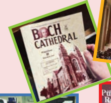
Back at the Cathedral