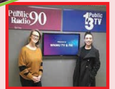
Studio Guests/ Arts Interviews