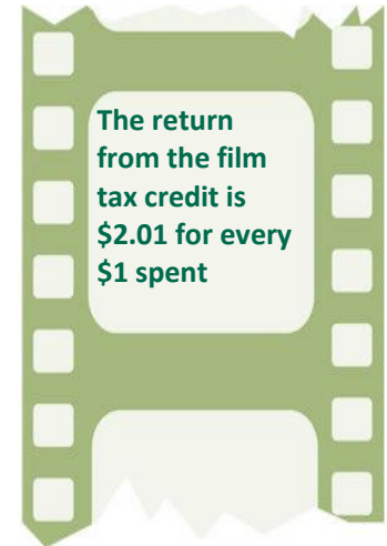
Table 4: Return on Investment of the Ohio Motion Picture Tax Credit, 2011-2015

The return on investment is found first by summing the total indirect and induced value added impact ($65.4 million) of the Ohio impact. This represents the production needed to support the industry (indirect) and the increased spending of local households (induced). The direct effect is not used in the return on investment calculation because it represents the spending of the film industry that would not have occurred in Ohio without the tax credit. Next, this statistic is divided by the total cost of Ohio’s investment in the film tax credit program ($32,577,384 23 ). Therefore, the total return for each dollar spent on the Ohio Motion Picture Tax Credit is $2.01. For each $1 spent by the state, an additional $1.01 is returned to the state economy (Table 4). 24