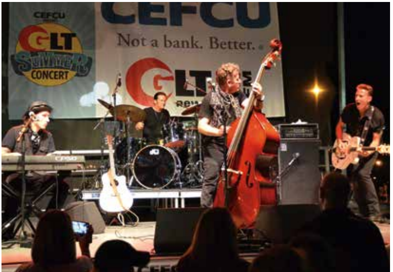
CEFCU presents the GLT Summer Concert: