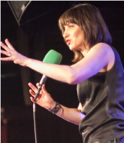
Ophira Eisenberg, host of Ask Me Another .