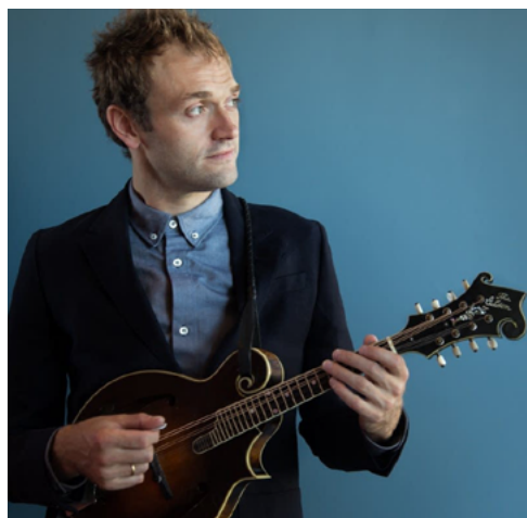
Chris Thile, host of A Prairie Home Companion .

Congratulations to Terry Gross on her National Humanities Medal for her "artful probing" on Fresh Air Mondays-Thursdays at 1 p.m. on KPBX, weekdays at 7 p.m. on KSFC.