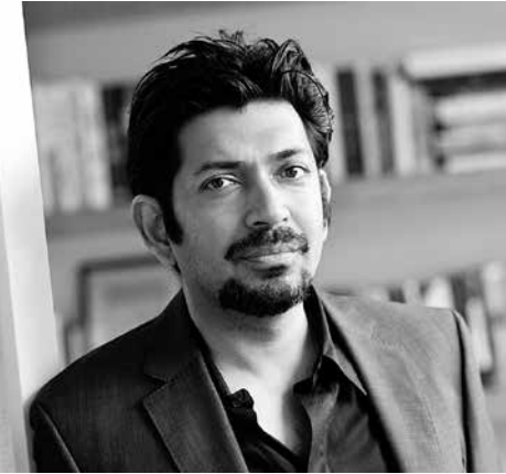
Siddhartha Mukherjee, on Binah 6/30.

and Drew Scott on selling, buying, renovating and designing a home; 6/16 Seth Stephens-Davidowitz explains the differences between what we tell people about our sex lives and what our Google searches reveal; 6/23 Esther Perel on the complex science behind human interaction.; 6/30 Cancer physician and Pulitzer Prize-winning author Siddhartha Mukherjee on The Gene - An Intimate History . (Thursday at Noon)