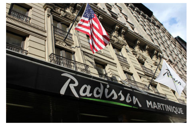
Radisson Martinique on Broadway near Macy's Herald Square

Our group will depart from Syracuse at 7 a.m. on Friday, May 9 and arrive at the Radisson Martinique in the afternoon. After check-in you are free to explore the city and all of its wonders. Take time to enjoy the arts at the Museum of Modern Art, or Carnegie Hall; explore Saint Patrick's Cathedral; take a tour; or see a Broadway show. Your time is your own! On Sunday, May 11, our coach departs the Radisson at 11 a.m.