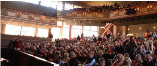
Inside the Alice Busch Theater, at Glimmerglass, Cooperstown

Join WRVO for "A day at the Glimmerglass Festival" August 4, 2014, for Rodgers and Hammerstein's classic Broadway musical Carousel with full orchestra with no electronic amplification. Pegged the "best musical of the 20th century" by Time magazine, Carousel tells the story of a carousel barker's struggles to rise above challenging circumstances. The musical includes such favorites as "If I Loved You," "June Is Bustin' Out All Over" and "You'll Never Walk Alone."