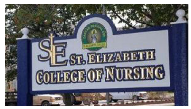
WRVO Public Media will resume our series of six regional health forums in Utica April 22nd. The event will be recorded for broadcast.

WRVO Public Media will hold a community health forum at St. Elizabeth Hospital April 22 at 3 p.m. This is one of a series of health forums WRVO is holding on public health issues throughout the listening region. Support for the forum comes from the Health Foundation for Western and Central New York .