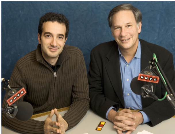
Jad Abumrad and Robert Krulwich host Radiolab. You won't believe your ears.