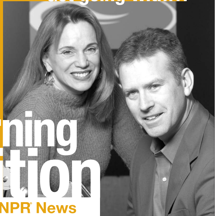
Hosts Renée Montagne & Steve Inskeep