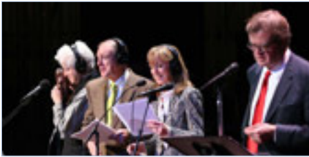
Garrison Keillor and cast of A Prairie Home Companion performing at Town Hall in New York City.

Fans of A Prairie Home Companion (heard Saturdays 6-8PM, Sunday noon-2PM), will board a tour bus December 7, 2013 bound for Town Hall in New York City. WRVO listeners have been in the audience for live broadcasts of A Prairie Home Companion with Garrison Keillor in New York each December since 2009. Part of the WRVO Discovery Tour series, the trip has become an annual tradition that includes free time in Manhattan during the afternoon prior to the show. The bus will return to central New York after the broadcast.