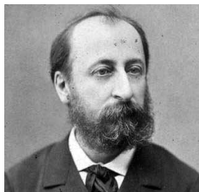
Camille Saint-Saëns Born in Paris, October 9, 1835 Died in Algiers, December 16, 1921

The struggles for the soul of music in 19th-century Germany formed opposing camps that have long been familiar to concert audiences. So-called Classical Romantics, such as Mendelssohn, Schumann, and Brahms, were pitted against an allegedly progressive group epitomized by Wagner and two honorary Germans: Berlioz and Liszt. Less well-known battles over musical values also raged in France, Italy, Russia, and elsewhere, and frequently dealt with the same issues: opera versus instrumental music, program versus absolute music, and who could most justly claim to be Beethoven's heir. Charles Gounod called Camille Saint-Saëns “the French Beethoven,” while Vincent d'Indy stated the same about his beloved teacher, César Franck.