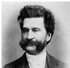
Johann Strauss, Jr. Born in Vienna, October 25, 1825 Died there, June 3, 1899

When Johann Strauss Jr.'s stepdaughter asked Johannes Brahms for an autograph, the illustrious composer wrote out the opening measures of the “Blue Danube” Waltz and signed it “Alas, not by Johannes Brahms.” The incident suggests that the brilliance, appeal, and spirit of Strauss's music could win the genuine admiration of one of the preeminent composers of the 19th century. It would be difficult to overstate the popularity and influence “The Waltz King” enjoyed as he virtually apotheosized the waltz into something more resembling a concept than a dance, in the process becoming the very personification of Vienna, as he remains to this day.