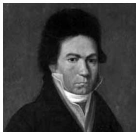
Ludwig van Beethoven

The conventional three phases of an artist's career— analogous to the life stages of youth, maturity, and old age—are nowhere more evident than in Beethoven's 16 string quartets. These extraordinary works chart the composer's artistic and spiritual growth over the course of his mature life, from his late 20s to shortly before his death at age 56 in 1827. It is hardly surprising that many prominent conductors, past and present, have found it hard to resist employing the resources of a full string orchestra to take these masterpieces of chamber music out of their original intimate surroundings and into the concert hall.