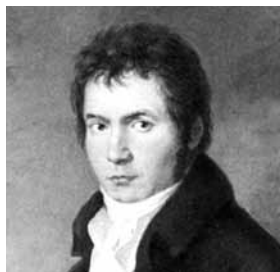
Ludwig van Beethoven Born in Bonn, probably December 16, 1770 Died in Vienna, March 26, 1827

Beethoven's Fourth Piano Concerto holds a special place in the unfolding of his career. It was the last of his five solo keyboard concertos that he wrote for his own use as a performer and even though it dates from his "heroic" middle period, it is an unusually intimate expression. Beethoven had composed his first three piano concertos relatively early in his career, during years of rising fame as a piano virtuoso and promising young composer. In these works he brought to a glorious culmination the Classical tradition of Mozart and Haydn, both of whom he knew personally. The Fourth and Fifth concertos represent Beethoven's style at the height of his popular success and as he forged new paths toward musical Romanticism.