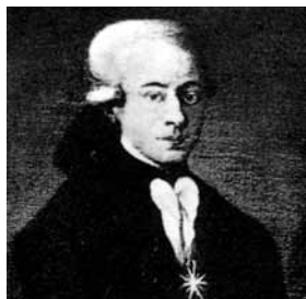
Wolfgang Amadè Mozart

Mozart may not have invented the piano concerto, but he was the composer who really made the genre matter. His earliest ones were in fact arrangements of piano sonatas by Johann Christian Bach and lesser lights; most likely they were assignments given to the young composer by his father. The Concerto in D major, K. 175, was Mozart's first independent piano concerto, which he wrote at age 17. Three more followed early in 1776, before the magnificent "Jenamy" Concerto in E-flat (K. 271) in January 1777, the month of his 21st birthday.