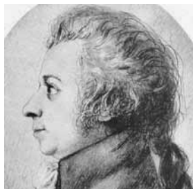
Wolfgang Amadè Mozart

Mozart's epochal final symphonies (Nos. 39, 40, and 41) are separated from his youthful first experiments in the genre by a period of little over two decades. Yet during this time both the composer and the symphony grew from infancy to ripe adulthood. In the case of the composer it was an amazingly accelerated maturation; Mozart's late symphonies bear as little resemblance to his works of the 1760s as Bruckner's do to Beethoven's. During this period Mozart had moved from provincial Salzburg to cosmopolitan Vienna, had all but captured the hearts of Europe with his operas and piano works, and had composed about 50 symphonies, many of which were already known in cities throughout Europe. The 32-year-old composer had no way of knowing, as he crafted three sublime symphonies in a period of three months in 1788—K. 543, K. 550, and K. 551—that these would be his last works in the form.