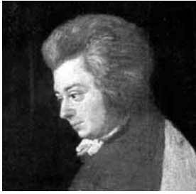
Wolfgang Amadé Mozart