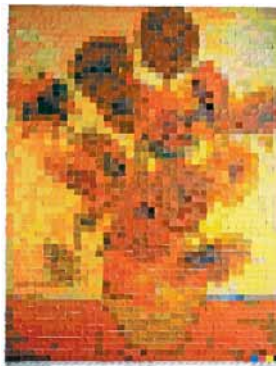
Sunflowers (after Van Gogh), © Vik Muniz.

This exhibition follows the evolution of the Aperture Foundation through a display of photographs from its print and fundraising programs made over a period of fifty years. In the process, it charts the evolution of photography itself.