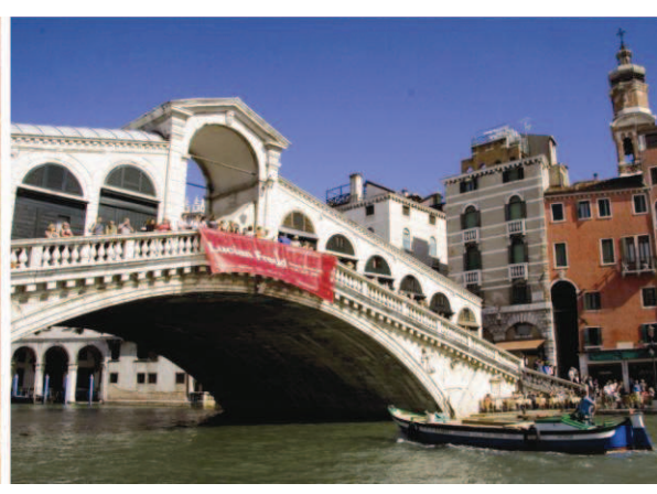
Day 8: Monday, November 12, 2012 Venice - Murano Island - Venice Your day begins with a boat trip** (weather permitting) to Murano Island for an up-close glass making demonstration. Next, return to Venice and visit charming St. Mark's Square, the lively hub of the city's activity and events. A local expert will guide you on a walking tour of the area featuring St. Mark's Basilica, the Doge's Palace, the Bridge of Sighs, and the

Clock Tower with its famous Moors. Today breakfast and dinner will be included.