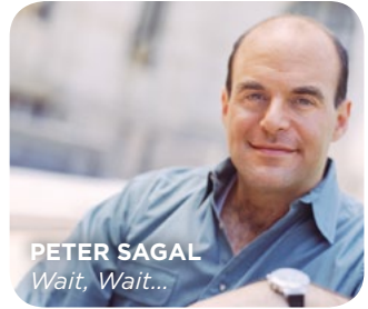
PETER SAGAL Wait, Wait...

Wait is NPR's weekly hour-long quiz program. Each week you can test your knowledge against some of the best and brightest in the news and entertainment world while figuring out what's real news and what's made up. Keep your dial tuned to 90.5 for the perfect mix of classical music, fact-based news, and engaging conversation.