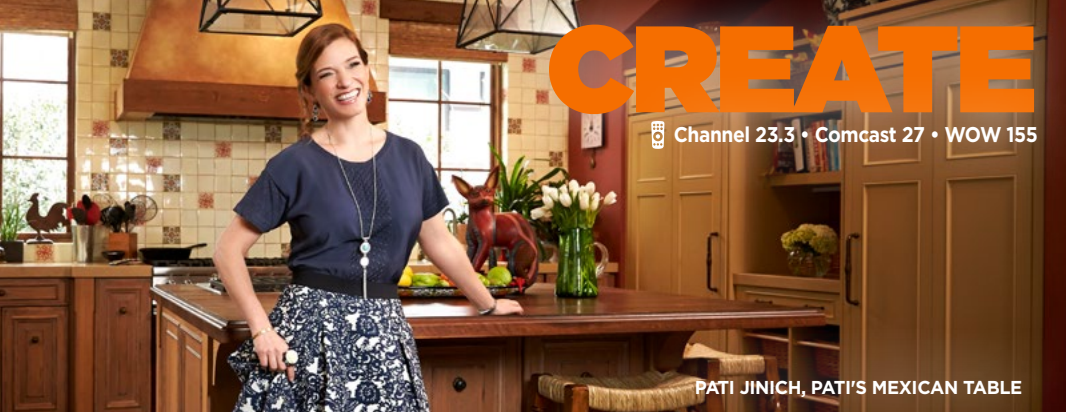
PATÍ JINICH, PATÍ'S MEXICAN TABLE