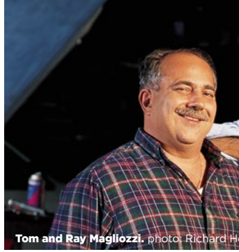
Tom and Ray Magliozzi.