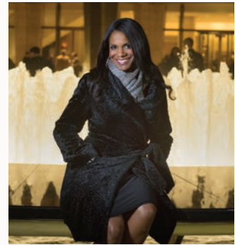
Audra McDonald performs on Live From Lincoln Center .