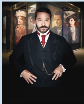
Jeremy Piven as "Mr. Selfridge" on Masterpiece .