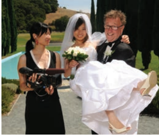
Seeking Asian Female looks at a non-traditional marriage.