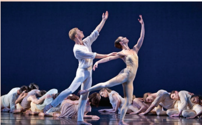
The Paul Taylor Dance Company on Great Performances .