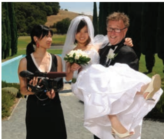
Seeking Asian Female looks at a non-traditional marriage.