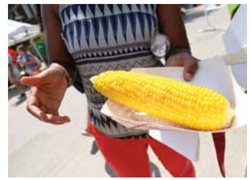
Sweet Corn Blues Festival Stage: CEFCU

GLTrees commemorative Tree Planting Friends of the Trail Niepagen Garden Center Community Cancer Center Stave Wine Bar Coffee Hound White Oak Brewing The Garlic Press Kemp's Upper Tap Patrick Murphy