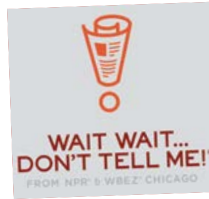
Wait, Wait ... Don't Tell Me! bus trip: Anonymous Sponsor