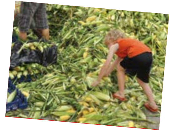
Sweet Corn Blues Festival Stage: CEFCU