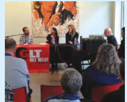
Show on local biking at University Galleries