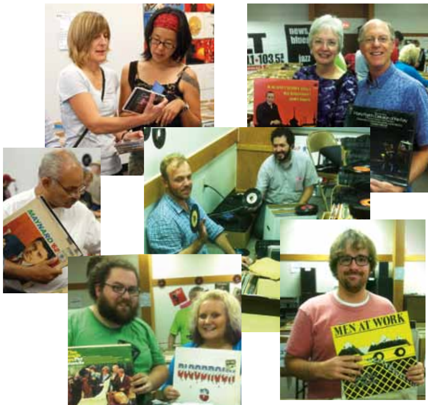
Recycled Music Sale: Good Vibrations for a lot of years - thanks.