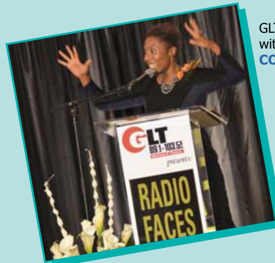
GLT Radio Faces with Audie Cornish COUNTRY Financial