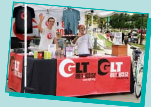
Sweet Corn Blues Festival Stage: CEFCU