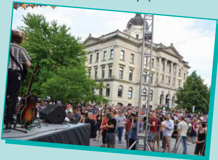
GLT Summer Concert: Ronda Glenn Law Offices Specs Around Town Eastland Chiropractic and Wellness Center Fox & Hounds Day Spa