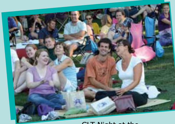
GLT Night at the Illinois Shakespeare Festival: Busey Bank