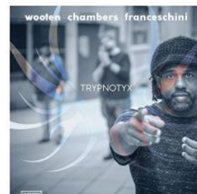
Trypnotyx Victor Wooten