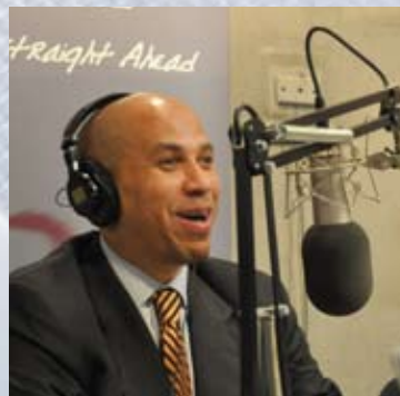
Mayor of New Jersey's largest city, Cory Booker, during the monthly call-in show on WBGO, Newark Today

The 2009 WBGO Champions of Jazz Benefit attracted over 1,000 guests and raised over $326,000