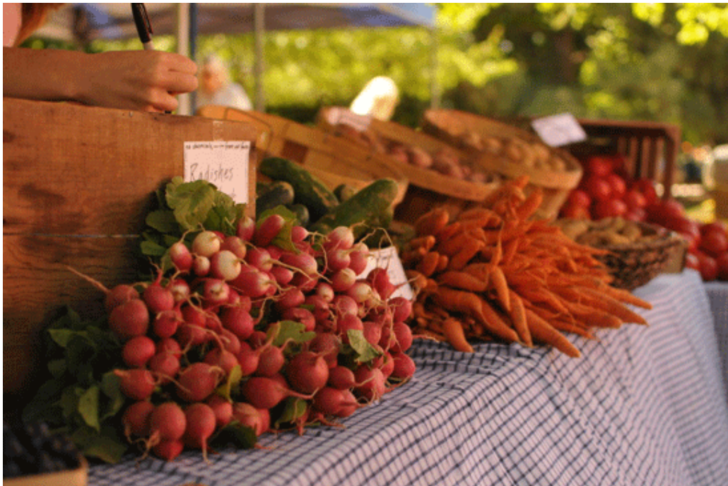
Purdue Farmers Market