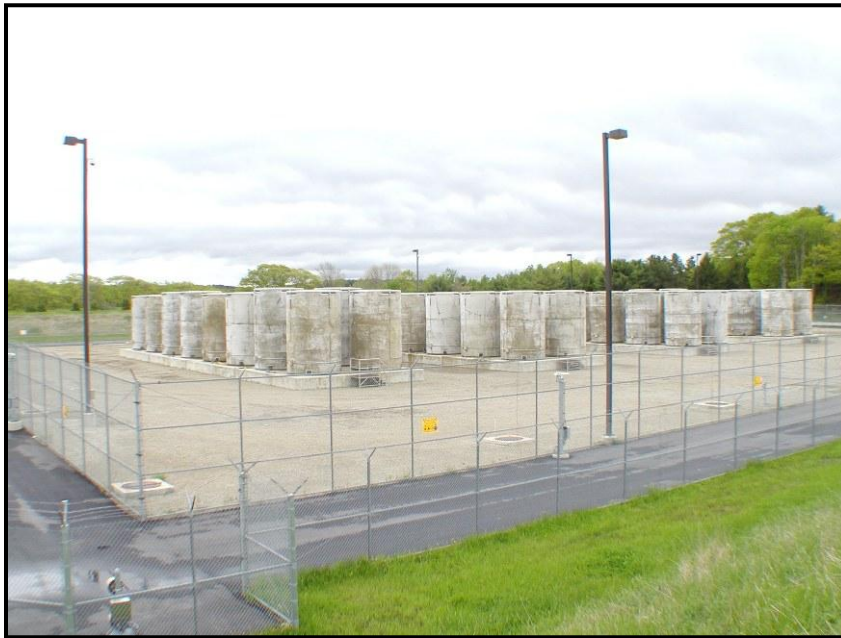
Maine Yankee Independent Spent Fuel Storage Installation (ISFSI)

natural gas was local and abundant and the conversion of some parts of plant infrastructure made economic sense. A fundamental factor that limits the redevelopment potential of decommissioned sites is the storage of spent reactor fuel on the site, and the related safety and security issues. Unless a permanent storage solution is adopted and executed by the federal government resulting in the permanent removal of spent fuel from the sites, this will remain a barrier.