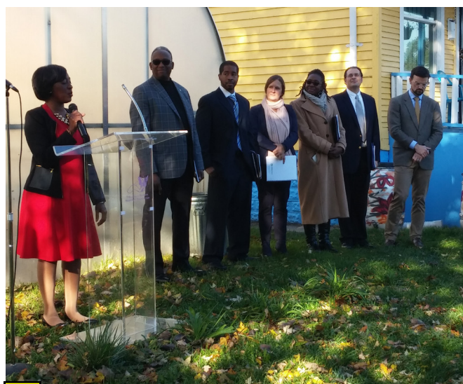
Residents provide the phone number to call MDEQ with odor complaints.

Specifically, inadequate combustion may cause increased emissions of metal oxides or vapors and metal vapors. 26 Additionally, the incomplete combustion of plastics can cause the emission of hazardous substances such as dioxins. 27 The incinerator is only required to conduct annual stack tests for these hazardous air pollutants. Therefore, the 1-hour carbon monoxide standard is important to ensure that the incinerator is adequately combusting its garbage and is not causing increased emissions of hazardous air pollutants such as dioxins. Additionally, due to a malfunction in its pollution control technology, the incinerator experienced a prolonged violation of its particulate matter standard.