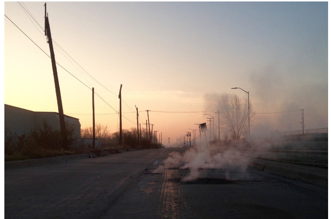
Steam is released along the steam loop displaying the inefficiency of the system.