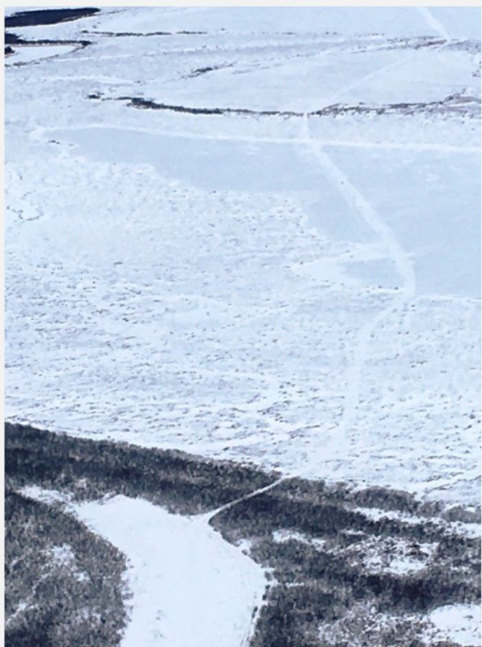
The always well-marked Eek Trail

Above Akiak all the way to Kalskag there is still a lot of work to be done.