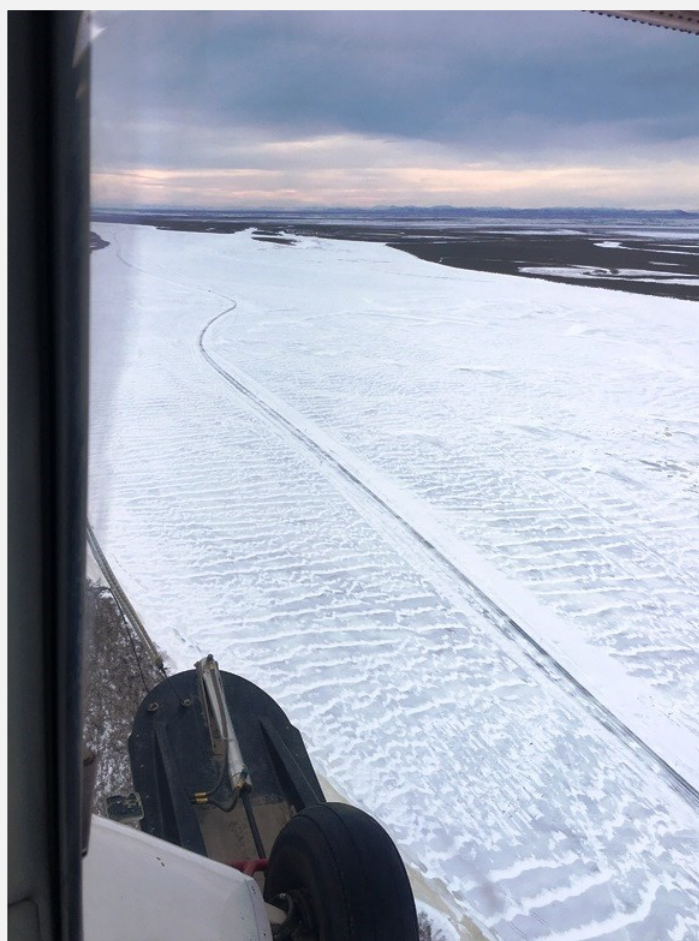
The Kusko Highway: well marked truck road