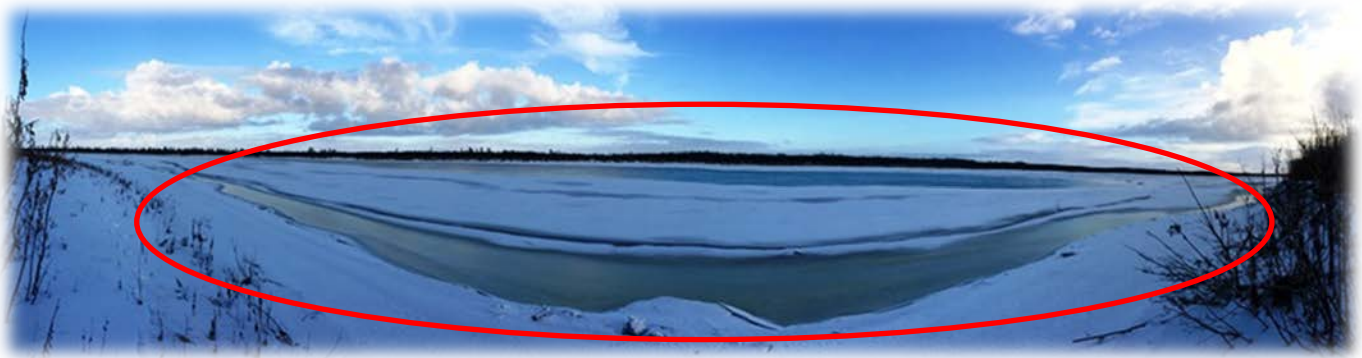
Deadly Zone: Kuskokwuak Slough has numerous large open holes both below and above Kwethluk

BSAR and other village SAR teams will be working on these as soon as we can get an aerial survey to locate them all.