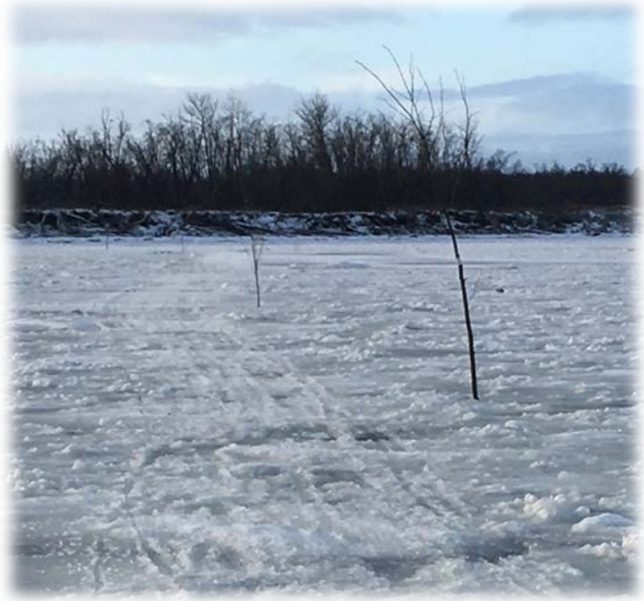
Markers on Kwethluk Trail – from the west bank above Tupuknuk Slough over to