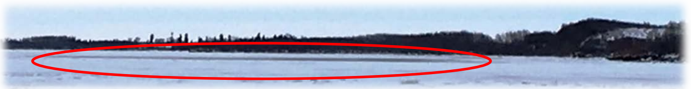
Open Hole in Front of the Bethel Bluffs