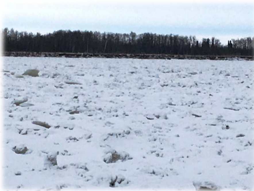
Rough River above Akiachak

From Akiachak upstream the River is pretty much all rough but not as rough as some years. It's a good thing the water got a chance to drop before it froze. There is some shell ice, but in most areas there are enough good beaches to drive on.