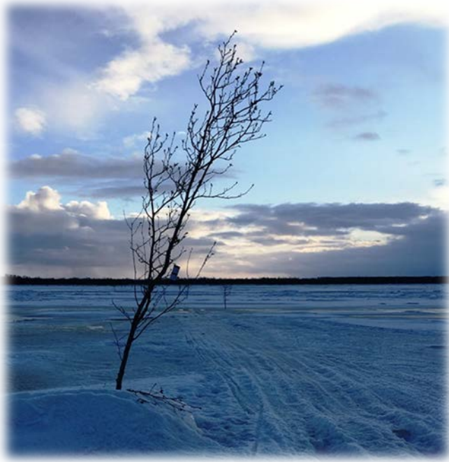
Oscarville – Napaskiak Trail Markers