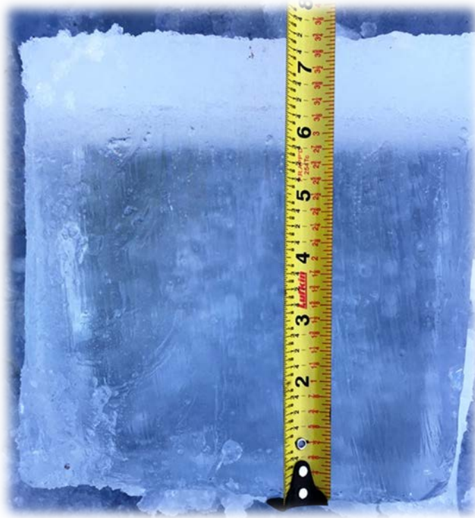
Ice measurement from mid-channel at Bethel: 6" of good clear ice – just barely enough for safe travel

Bethel Search & Rescue P.O. Box 2633 Bethel, Alaska 99559 (907) 543-5078