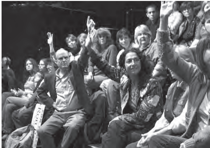
Austinites vie to express their opinions during the live broadcast of BBC — World Have Your Say