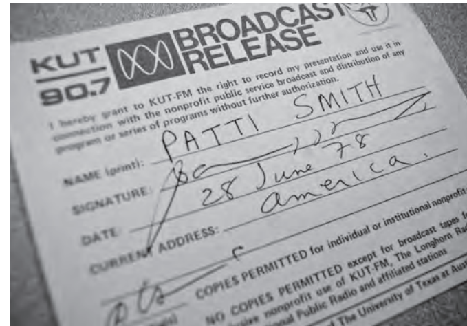
Patti Smith broadcast release.