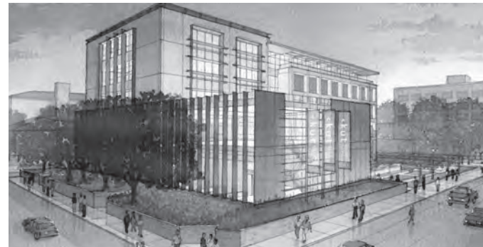
Architectural rendering of the KUT Public Media Studios, opening in fall of 2012, on the corner of Dean Keeton and Guadalupe.

We look forward to the KUT Public Media Studios becoming a daily destination for robust discussions of critical issues, unique live musical performances and cultural experiences — a place where you can experience Austin, Texas.