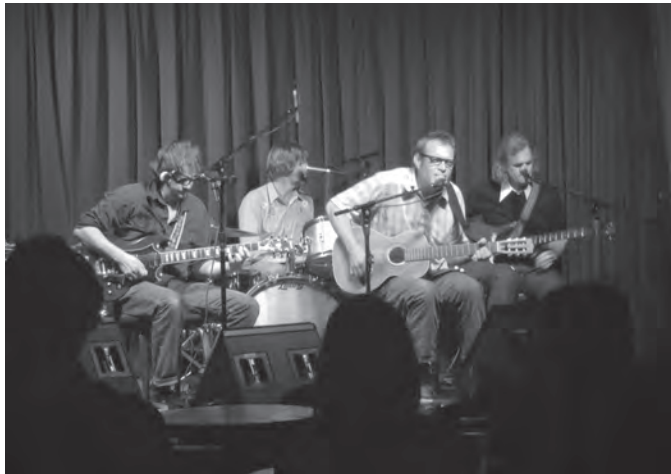
Li'l Cap'n Travis performs in the Cactus Cafe.

Believing the Cactus Cafe could complement KUT’s vision, we proposed a plan to preserve it through a partnership in which KUT would develop, over time, a sustainable business model and oversee programming operations.