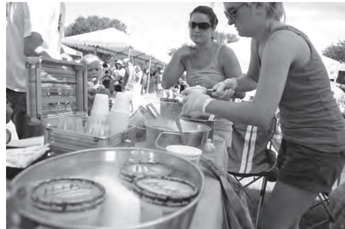
Organizers serve up cool treats at the 2010 Austin Ice Cream Festival.

For more than 15 years KUT has been home to Latino USA , the weekly English-language radio magazine produced from a Latino perspective. The half-hour program was created as a collaboration of The University of Texas at Austin's Center for Mexican American Studies and KUT, where it had been produced since 1993. Since then, Latino USA has become an award-winning news and culture program and a weekly destination for millions of listeners. In 2010 Latino USA became an independently sustainable production of Futuro Media Group lead by host and managing editor Maria Hinojosa at her home base in New York City. We will be forever proud for having a role in nurturing this program and will celebrate in its future success.