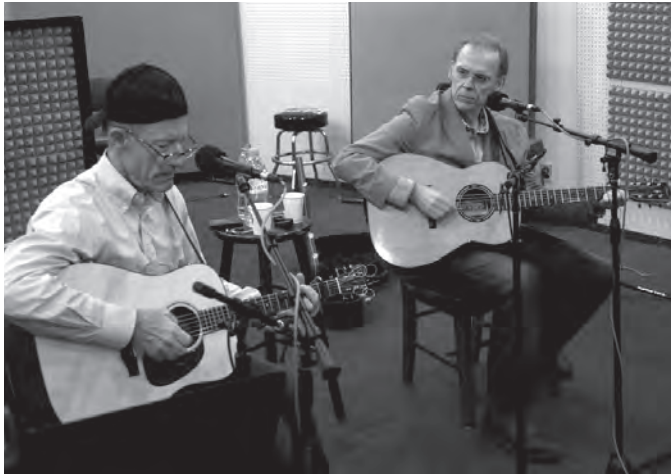
Lyle Lovett and John Hiatt perform in Studio 1A in June 2011.

Last spring, the Cactus Cafe made its international debut in a