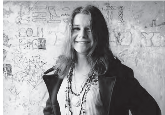
Piece of My Heart: The Story of Janis Joplin aired in 2010.