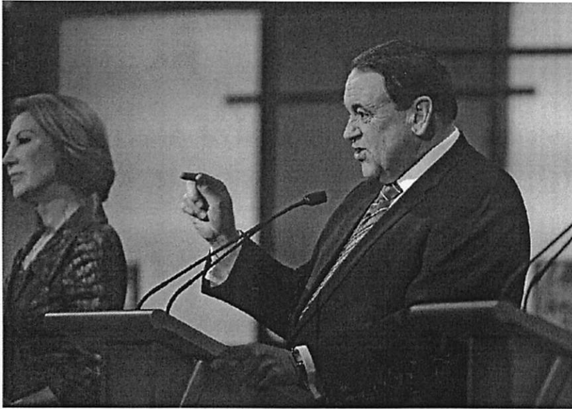
Former Arkansas Gov. Mike Huckabee makes a point during one of Thursday night's debates in Des Moines, Iowa. Huckabee won the Iowa caucuses eight years ago but trails in the polls this year.