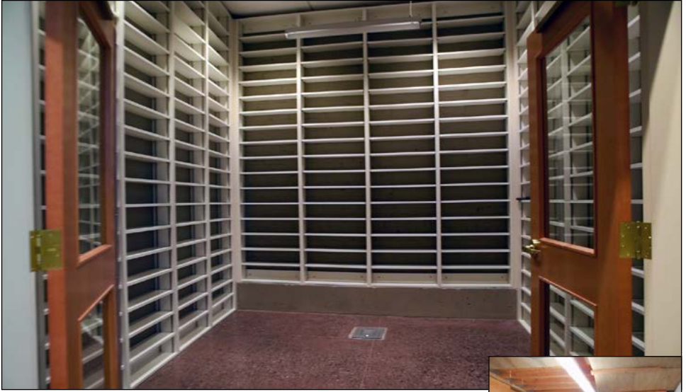
Above: Fill 'er up! The Herb A & Billie Severtson Main Classical & Jazz CD Library just off the new Performance Studio can hold 11,000 CDs comfortably. Right: The library space began as a storage nook.