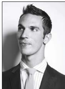
Ari Shapiro co-hosts All Things Considered , NPR's afternoon news magazine weekdays from 1-3 p.m. and partially repeated 6-7 p.m. on KSFC.