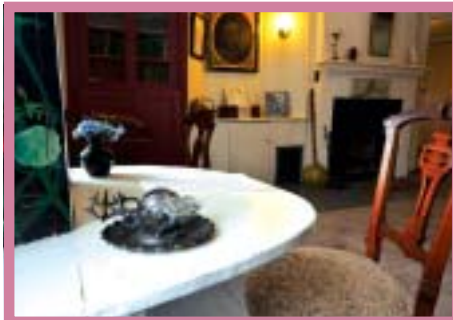
Louisa May Alcott’s desk