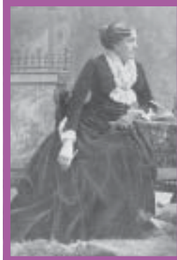
Above, Louisa May Alcott is shown in 1858 at age 26, and later in life with pen, c. 1880.