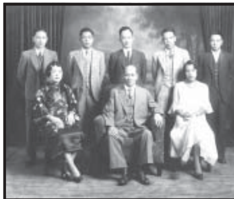
Though like the Lim Family—American born and educated—The Chinese Exclusion Law made it difficult for the younger generation to find employment, forcing many to seek opportunities back in China.