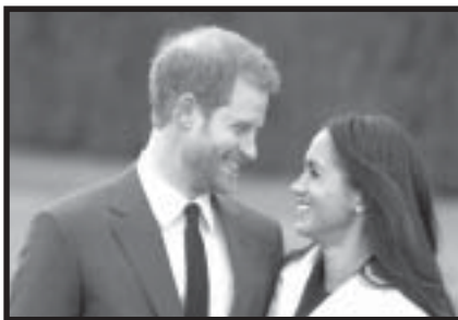
Prince Harry and Meghan Markle

Royal Wedding Watch will be broadcast on 3-2 Monday–Friday, the 14th–18th, at 9:00 p.m. On 3-1, the series can be seen the same weeknights at 10:00 p.m.