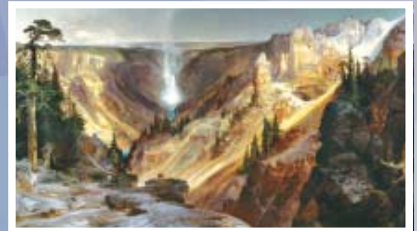
Thomas Moran, 1871