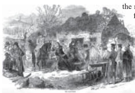
Ejection of Irish Tenantry

Ireland's Great Hunger and the Irish Diaspora airs on 3-2 Sunday, the 3rd at 10:00 a.m., Thursday, the 21st at 7:00 p.m., and Friday, the 29th at 10:00 p.m. On 3-1, it airs Monday, the 18th at 7:00 a.m.