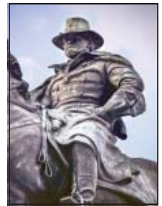
Ulysses S. Grant

could hear the sound of military bands and cheering crowds as the Confederate soldiers disembarked. By the next morning, June 18th, Early had a force numbering about 12,000 soldiers. They stood ready to defend Lynchburg using two earthen forts that were connected by trenches and rifle pits dug during the night. From dawn until early afternoon, the artillery of both sides opened up, and for several hours cannon shells flew fast and thick. By late afternoon, Union forces fell back and went into camp.