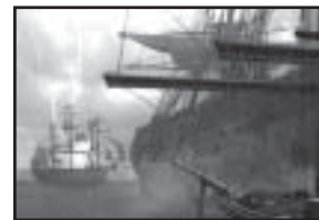
The Battle of Baltimore

F. S. Key and the Song that Built America airs Sunday, September 7th at 9:30 p.m., Friday, September 19th at 10:00 p.m., and Sunday, September 21st at 7:00 p.m. On HD3-1, it airs Wednesday, September 17th at 7:00 a.m. and 1:00 p.m.