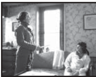
(L-R): A re-enactment of Thomas Jefferson and Thaddeus Kosciuszko meeting

Thaddeus Kosciuszko was a Polish-Lithuanian military engineer and strategist who came to America in 1776 to volunteer for the Continental Army. During the American Revolution, Kosciuszko designed and oversaw the construction of state-of-the-art fortifications, including West Point. It was Kosciuszko's plans for the fort that Benedict