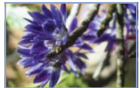
This fragile-looking orchid, Queen Victoria's dendrobium, is tougher than it looks.

Plants Behaving Badly can be seen on 3-2 Wednesdays at 9:00 p.m. beginning the 3rd. On 3-1, it airs Wednesdays at 8:00 p.m. beginning the 3rd and Thursdays at 7:00 a.m. beginning the 4th.