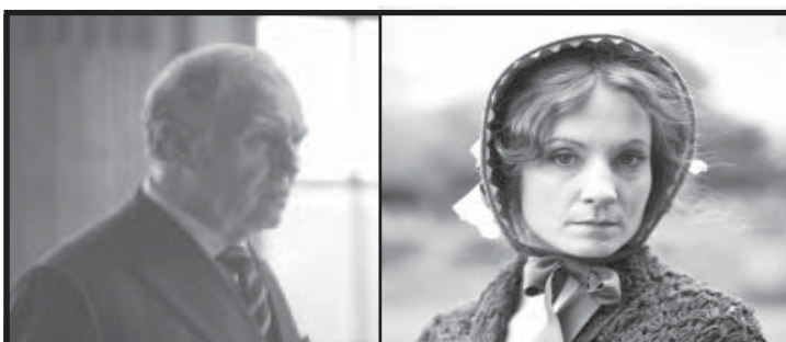
(LtoR) Tim Pigott-Smith stars in “King Charles III” and Joanne Froggatt portrays Victorian serial poisoner Mary Ann Cotton in “Dark Angel,” both specials premiering on MASTERPIECE.

“King Charles III” on Masterpiece will be broadcast on 3-2 Sunday, the 14th at 8:00 p.m. and Friday, the 19th at 11:00 p.m. On 3-1, it can be seen Sunday, the 14th at 7:00 p.m. and Monday, the 15th at 7:00 a.m. and 2:00 p.m.