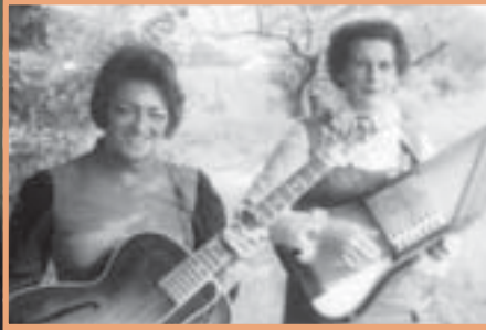
Sara and Maybelle Carter