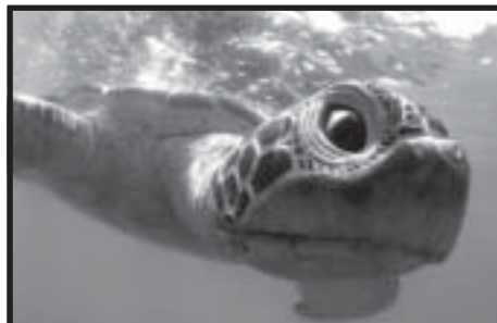
Spy turtle underwater

It's "Just" Anxiety will be broadcast on 3-2 Sunday, the 28th at 10:00 a.m.