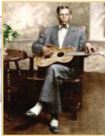
Only known photo of the "Father of the Delta Blues," Charley Patton