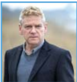
Kenneth Branagh stars as Inspector Kurt Wallander in the final season of the series.

From Wallander’s first season on Masterpiece in 2009, the protagonist’s days have always seemed numbered. Dealing with northern Europe’s most violent and derailed criminals, Wallander also battles personal demons and appalling health habits, which led him to be diagnosed with diabetes. Now, as he starts to lose his memory, his greatest fear is that he is succumbing to the same disease that felled his father: Alzheimer’s.