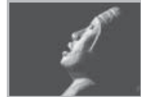
In "Teotihuacán's Lost Kings," the team finds four statues in the end chamber that might represent ancestors that could have functioned as guardians.

"Teotihuacán's Lost Kings" on Secrets of the Dead airs on 3-2 Tuesday, the 24th at 8:00 p.m. and Sunday, the 29th at 10:00 a.m. On HD3-1, it airs Tuesday, the 24th at 9:00 p.m. and Wednesday, the 25th at 7:00 a.m. and 2:00 p.m.