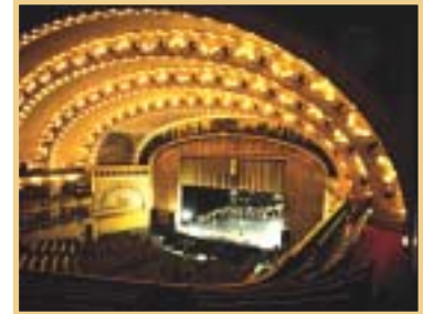
Performances from the LYRIC OPERA OF CHICAGO begin Saturday, May 14th at 11:00 a.m. on KENW/KMTH-FM .

11:00 p.m. JAZZ NIGHT Hosted by multiple Grammy Award-winning musician Christian McBride, this weekly series presents content on multiple platforms and from across the nation to share this uniquely American art form and reinvigorate public media jazz programming for audiences today. 12:00 a.m. MUSIC OUT OF THE NIGHT AND INTO THE MORNING until 6:00 a.m. when Weekend Edition begins.