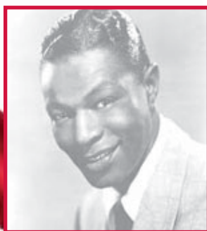
Nat King Cole

Joy Bauer's From Junk Food to Joy Food airs Saturday, the 5th at 10:00 a.m. and Saturday, the 19th at 2:00 p.m. On HD3-1, it airs Monday, the 7th at 7:00 p.m. and Saturday, the 12th at 2:00 p.m.