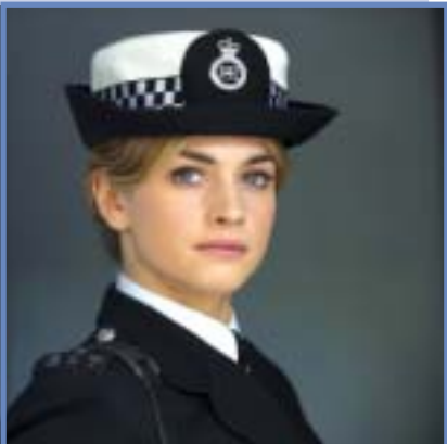
Jane Tennison (Stefanie Martini)

"Prime Suspect: Tennison," the highly anticipated prequel to the hit series "Prime Suspect," is a six-part drama that portrays the early career of one of television's most iconic detectives, Jane Tennison—the role that established Dame Helen Mirren as a household name in the groundbreaking Masterpiece series "Prime Suspect."