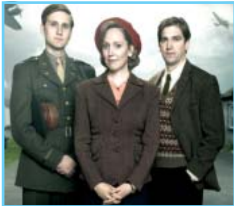
(LtoR): Captain Ronald Dreyfus (Aaron Staton), Rose Coyne (Hattie Morahan), Michael Coyne (Owen McDonnell)

Moybeg in 1943, bringing hundreds of gum-chewing, swing-band-listening American airmen to a remote Ulster farming community, with its winsome women and stolid working men.