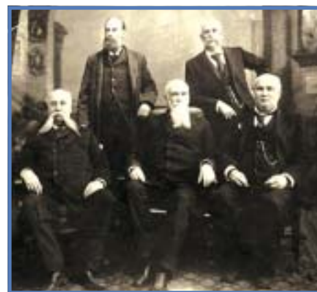
Court of Private Land Claims

Peering through the lens of the federal court system, its judges and institutions, Taming New Mexico canvasses over 300 years of law in New Mexico history, documenting how New Mexico transitioned from the Spanish-Mexican rule of law to today's American legal system. The film chronicles the pivotal cases, significant issues, and powerful personalities that shaped and transformed New Mexico's legal and cultural landscape.