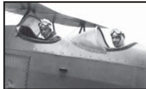
Charles and Anne Morrow Lindbergh