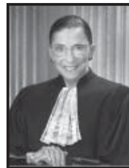
Supreme Court Justice Ruth Bader Ginsburg

Balancing the Scales airs on 3-2 Monday, the 24th at 9:00 p.m. On 3-1, it airs Tuesday, the 25th at 7:00 p.m. and Wednesday, the 26th at 6:00 a.m. and 1:00 p.m.