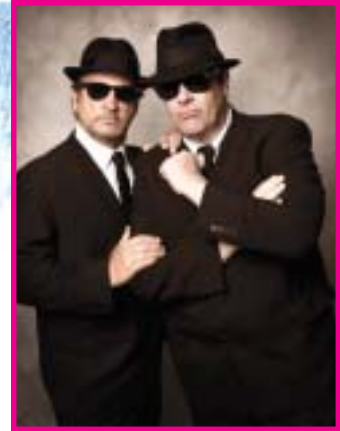
The Blues Brothers