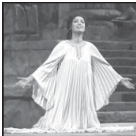
Soprano Nadine Sierra stars as Ilia in Mozart's "Idomeneo" on GREAT PERFORMANCES AT THE MET.

"Idomeneo" on Great Performances at the Met will be broadcast on 3-2 Sunday, 30th at 12:30 p.m. On 3-1, it can be seen Sunday, the 16th at 2:00 p.m.