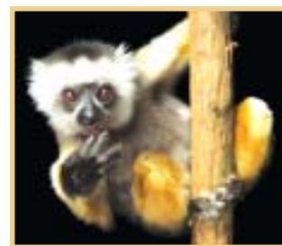
This critically endangered Diademed sifaka takes refuge at Lemuria Land in Madagascar.