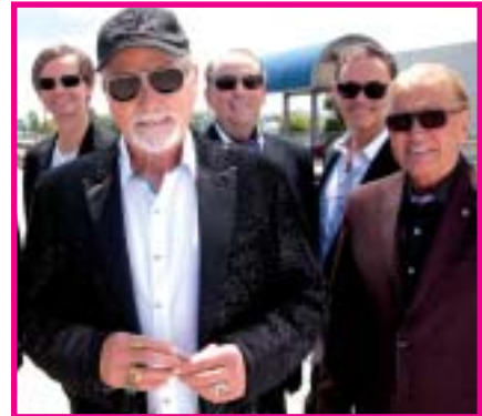
The Beach Boys