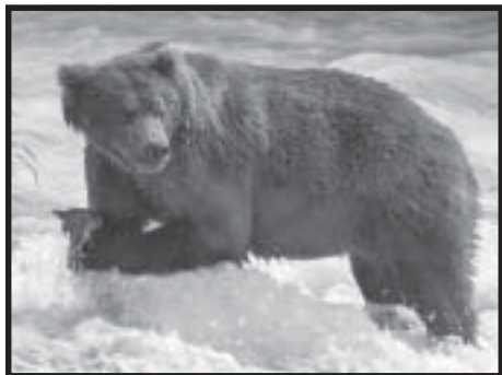
Brown bear catching salmon in Brooks Falls Katmai National Park and Preserve, Alaska

Wild Alaska Live visits several locations, including points near Juneau and the