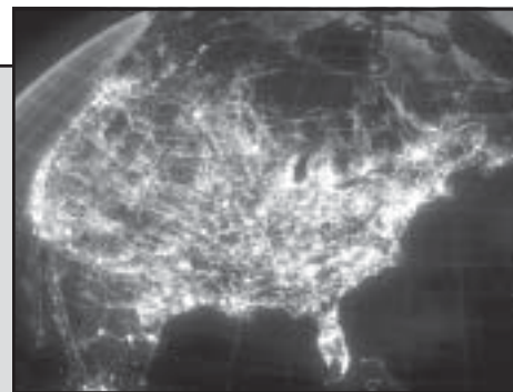
North America's Electric Grid