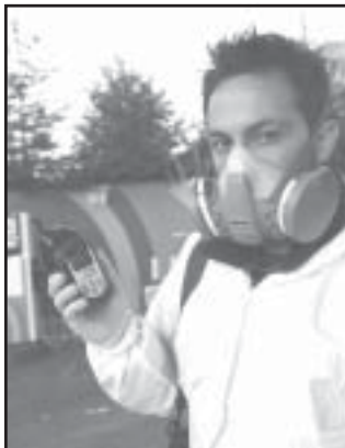
Dr. Derek Muller at Fukushima, Japan

Uranium: Twisting the Dragon's Tail airs (Pt. 1) Tuesday, the 28th at 9:00 p.m. and (Pt. 2) Wednesday, the 29th at 9:00 p.m. On HD3-1, it airs (Pt. 1) Tuesday, the 28th at 7:00 p.m. and Wednesday, the 29th at 8:00 a.m. and 2:00 p.m. and (Pt. 2) Wednesday, the 29th at 7:00 p.m. and Thursday, the 30th at 8:00 a.m. and 2:00 p.m.