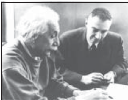
Albert Einstein and Robert Oppenheimer

The Bomb airs Tuesday, the 28th at 7:00 p.m. On HD3-1, it airs Tuesday, the 28th at 8:00 p.m. and Wednesday, the 29th at 6:00 a.m. and 12:00 noon.