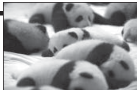
Some of the 14 baby panda cubs born this year in China’s world leading panda breeding center in Wolong.

Across the globe, these are stories of ingenuity, invention, and dedication that include the southwest China giant panda base using human neo-natal techniques to keep baby pandas alive; a rhino vet working with a plastic surgeon in South African to carry out the world’s first rhino skin graft; a team of vets attempting groundbreaking keyhole