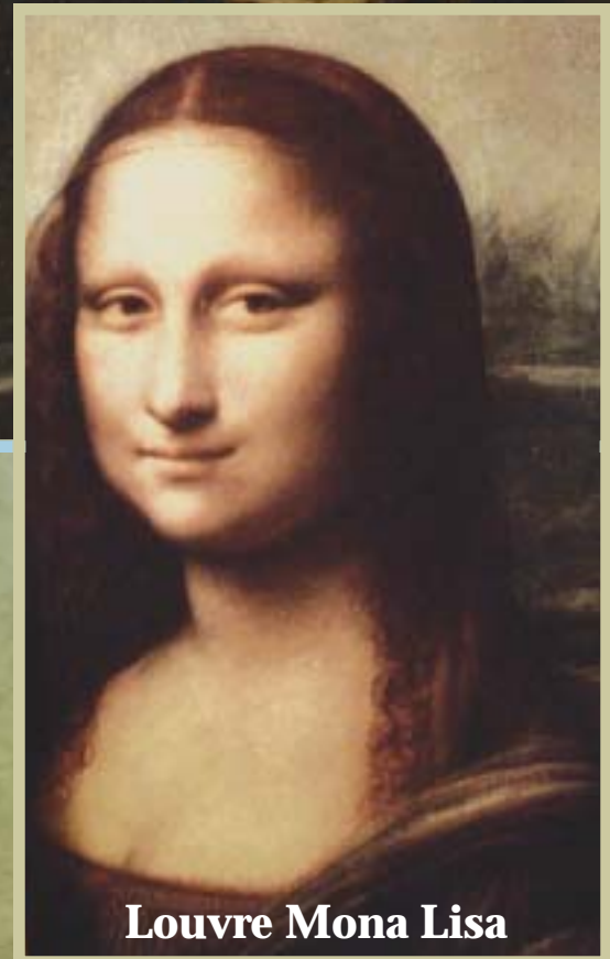
Louvre Mona Lisa