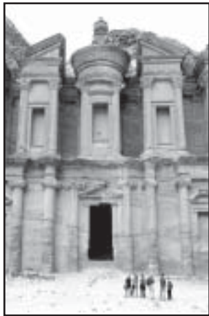
The scanning team looks up at the Monastery, the largest monument at Petra, Jordan.

The Time Scanners team travels first to Egypt to scan the pyramids—the tombs of the mighty pharaohs—to find out how the necropolis evolved from simple mud-brick structures to the most impressive buildings in the ancient world. They use their cutting-edge laser technology to scan Djoser’s Step Pyramid at Saqqara; Meidum’s collapsed pyramid; the mysterious Bent Pyramid at Dashur; and the famous Great Pyramid at Giza.