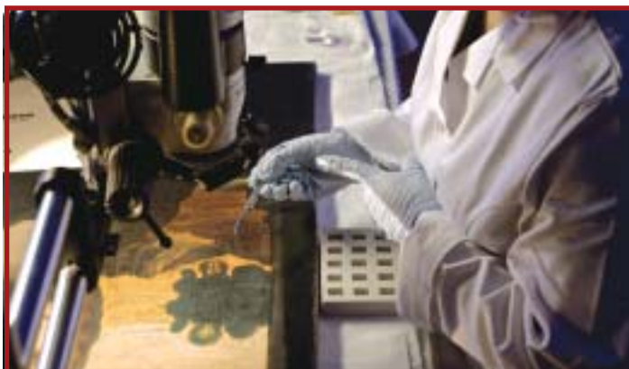
Re-enactment: Taking a sample of the “Isleworth Mona Lisa”