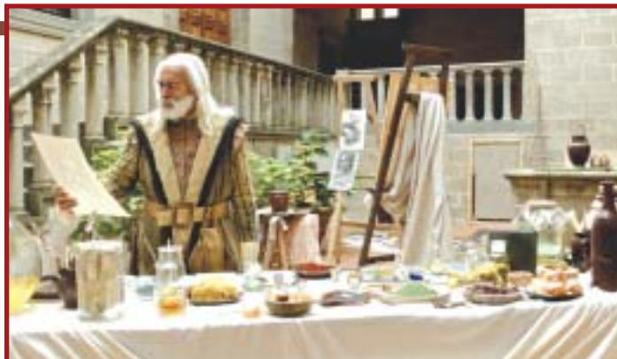
Re-enactment: Leonardo in his studio

“The Mona Lisa Mystery” on Secrets of the Dead will be broadcast Wednesday, July 9th at 9:00 p.m., Sunday, July 13th at 10:00 p.m., and Sunday, July 27th at 10:00 a.m. On HD3-1, it can be seen Wednesday, July 9th at 9:00 p.m., Thursday, July 10th at 11:00 a.m. and 4:30 p.m., and Sunday, July 13th at 3:00 p.m.