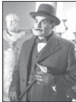
David Suchet reprises his role as Belgian super-sleuth Hercule Poirot.

David Suchet returns to Masterpiece Mystery! in his role as suave Belgian super-sleuth Hercule Poirot in two new thrillers, “The Big Four” and “Dead Man’s Folly,” based on the novels by Agatha Christie. Whether he’s on holiday abroad, taking a countryside break, or simply going about his business, Poirot exercises his “little grey cells” by helping police investigate crimes and murders, whether they ask for his help or not.