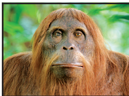
Animatronic “spycam” disguised as an Orangutan in the Borneo forest.

“Spy in the Wild” on Nature airs on 3-2 Wednesdays at 7:00 p.m. beginning the 1st and repeats Saturdays at 11:00 p.m. On 3-1, it airs Wednesdays at 9:00 p.m. beginning the 1st and repeats Thursdays at 8:00 a.m./3:00 p.m.