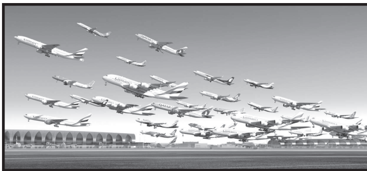
GFX Image of planes taking off from Dubai International Airport

City in the Sky will be broadcast on 3-2 Wednesdays 9:00 p.m. beginning the 8th. On 3-1, it can be seen Wednesdays at 8:00 p.m. beginning the 8th and Thursdays at 7:00 a.m. and 2:00 p.m. beginning the 9th.