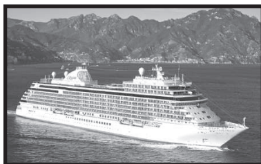
The Seven Seas Explorer

In Italian shipyards, engineers are working around the clock to build the world's largest and most luxurious cruise ship, costing half a billion dollars. “Ultimate Cruise Ship” on Nova follows the teams' setbacks and triumphs as they struggle to meet their deadline to create a floating paradise.