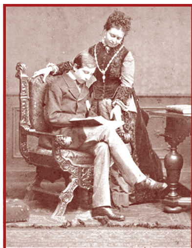
Empress Vicky (Victoria, Princess Royal), eldest daughter of Queen Victoria, and her son, the future Kaiser Wilhelm II

Queen Victoria and the Crippled Kaiser airs on 3-2 Sunday, the 12th at 9:00 p.m./11:00 p.m. and Friday, the 17th at 11:00 p.m. On 3-1, it airs Monday, the 20th at 8:00 a.m./3:00 p.m. and Sunday, the 26th at 9:00 p.m.