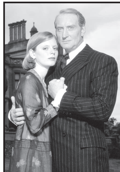
In REBECCA , Emilia Fox portrays Mrs. de Winter and Charles Dance stars as Mr. de Winter.

Rebecca will be broadcast on 3-2 Sunday, the 26th at 7:00 p.m. On 3-1, it can be seen Sunday, the 12th at 8:00 p.m.