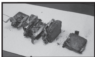
After a crush test at the Battery Abuse Testing Lab at Sandia National Labs in New Mexico, these incinerated parts are all that's left of the battery.

Even though there have been some improvements in the last century, batteries remain finicky, bulky, expensive, toxic, and maddeningly short-lived. The quest is on for a “super battery,” and the stakes in this hunt are much higher than the phone in your pocket. With climate change looming, electric cars and renewable energy sources like wind and solar power could hold keys to a greener future... if we can engineer the perfect battery.