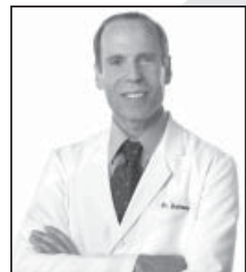
Dr. Joel Fuhrman

Dr. Fuhrman's End Dieting Forever! airs Saturday, August 9th at 2:00 p.m., Tuesday, August 12th at 7:00 p.m., and Sunday, August 17th at 12:00 noon. On HD3-1, it airs Saturday, August 16th at 6:00 p.m.