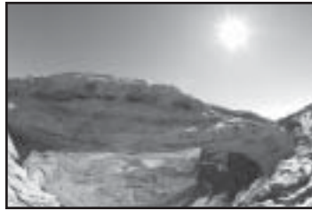
Mesa Arch, Canyonlands, Utah

Red Rock Serenade will be broadcast Saturday, August 9th at 10:00 p.m., Monday, August 11th at 8:00 p.m., and Sunday, August 17th at 5:00 p.m. On HD3-1, it airs Sunday, August 17th at 6:00 p.m. (ON THE COVER: Dead Horse Point, Canyonlands)