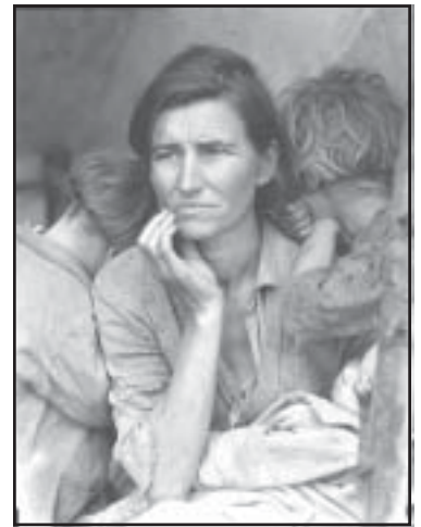
Migrant Mother (1936)

American Masters "Dorothea Lange: Grab a Hunk of Lightning" can be seen Friday, August 29th at 9:00 p.m. and Sunday, August 31st at 9:30 p.m. On HD3-1, it can be seen Friday, August 29th at 8:00 p.m. and Saturday, August 30th at 7:00 p.m.