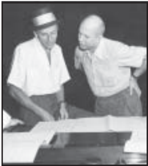
Frank Sinatra and Jimmy Van Heusen

Jimmy Van Heusen: Swingin' with Frank & Bing celebrates the four-time Oscar-winning composer and test pilot who wrote high-flying songs for his legendary pals—Frank Sinatra and Bing Crosby—including "Swinging on a Star" and "Moonlight Becomes You" for Bing Crosby and "Come Fly With Me" for Frank Sinatra, plus "Call Me Irresponsible," "The Tender Trap," "All the Way," "High Hopes," "Here's That Rainy Day," and many others. Sinatra recorded over 80 songs by Van Heusen—more than any other composer. They were close friends and musical kindred spirits, "they got into music together, they got into movies together and they got into trouble together," says Frank Sinatra, Jr.