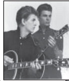
The Everly Brothers