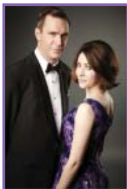
Jack Davenport stars as Dr. Otto Powell and Catherine Steadman portrays Angela Wilson in "Breathless."

Jack Davenport, Zoe Boyle, and Catherine Steadman team up for a medical series with astounding suspense, supreme satire, and smart sixties style on "Breathless," airing in three parts on Masterpiece Mystery!