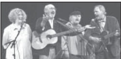
Left to right: Holly Near, Noel Paul Stookey, Tom Paxton, and Tom Chapin

On January 17th, 2014, Noel Paul Stookey (of Peter, Paul and Mary), Tom Paxton, Tom Chapin, Holly Near, and other folk greats came together at New York City's Symphony Space for a live performance to celebrate the 45th anniversary of "Woody's Children," the iconic American folk radio show. Named after a phrase coined