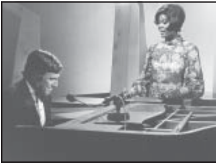
Burt Bacharach and Dionne Warwick

For over half a century, the popular melodies of celebrated composer Burt Bacharach have touched millions of music lovers around the world. Bacharach established himself in the 1960s, creating some of the most beloved and successful pop music ever to grace radio, television, and film. Hosted by