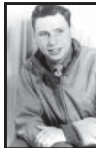
Mel Brooks, then Melvin Kaminsky, 19, in France, c. 1944

GI Jews: Jewish Americans in World War II can be seen on 3-2 Wednesday, the 11th at 9:00 p.m. On 3-1, it airs Thursday, the 12th at 7:00 p.m.