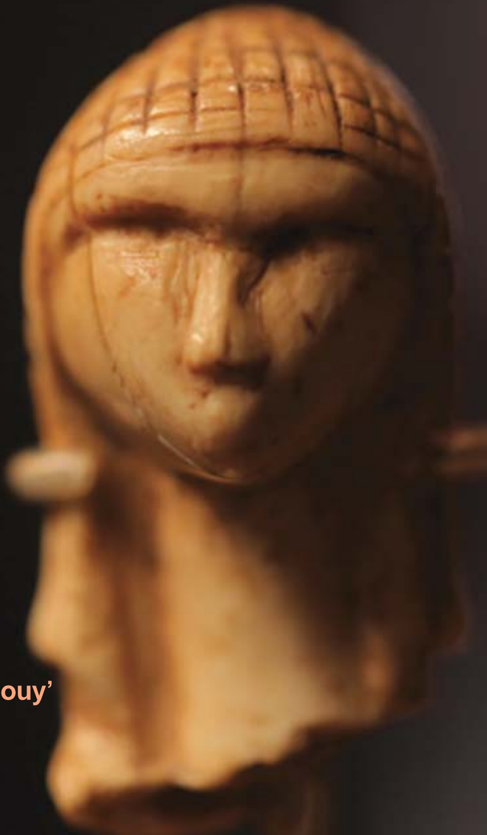
The Lady of Brassempouy' (c. 23,000 BCE)

Program Guide KENW-TV/FM Eastern New Mexico University April 2018