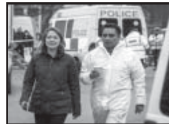
Nicola Walker stars as DCI Cassie Stuart and Sanjeev Bhaskar as DS Sunny Khan.

Season 1 of the critically-acclaimed series opens with a human skeleton found beneath a demolished house. The remains could be centuries old—or four decades, as comes to light upon further investigation of the crime scene.