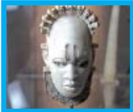
Queen Idia (16th Century)