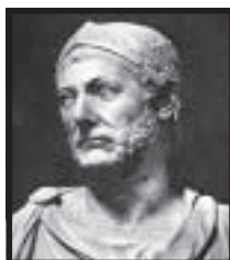
In Capua, Italy, this marble bust is reputed to be that of Hannibal.

Secrets of the Dead "Hannibal in the Alps" can be seen on 3-2 Tuesday, the 10th at 7:00 p.m., Sunday, the 15th at 10:00 a.m., and Monday, the 23rd at 10:00 p.m. On 3-1, it airs Tuesday, the 10th at 8:00 p.m.