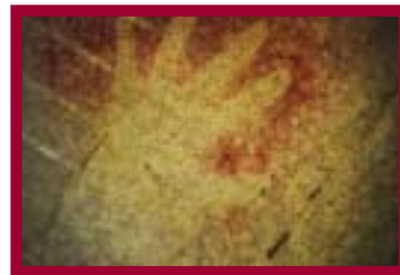
Hand Stencil found in cave, Spain (c. 37,000 BCE)

From the landscape scrolls of classical China and the sculpture of the Olmecs to African bronzes, Japanese prints, and French Impressionist paintings; from the stained glass windows of Chartres cathedral to Matisse’s cardboard cut-outs; from the great dome of the Suleymaniye mosque to the paintings of the Dutch Golden Age; and from Hokusai’s Wave to Monet’s Rouen cathedral series,