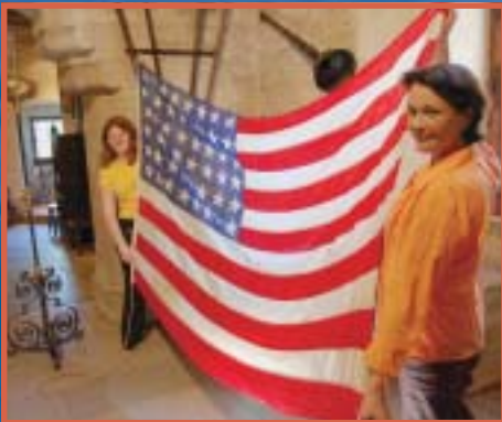
This U.S. flag was flown over Chateau de la Rochepot in Burgundy, France, on Liberation Day in 1945.