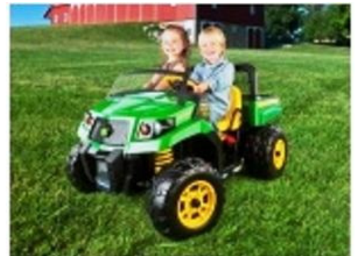
John Deere Gator for Kids

I hope you will check out our Auction and also tell your e-mail friends and family to go to: http://auction.kenw.org The money certainly goes for a good cause, and helps us with production costs for " Creative Living ." We will begin taping for the 36th season of the show next Fall, and I can hardly wait.